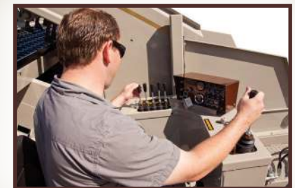
Controls Operator platform with intuitive controls