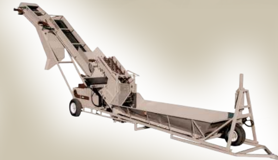
Dirt Extraction Elevator Dual belt elevator with upper dirt extraction chain

Self-propelled three belt system with 90° upper conveyor