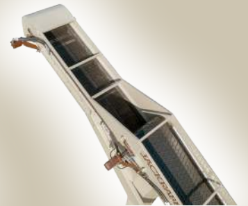
Dirt Chain Heavy duty twin-rod chain