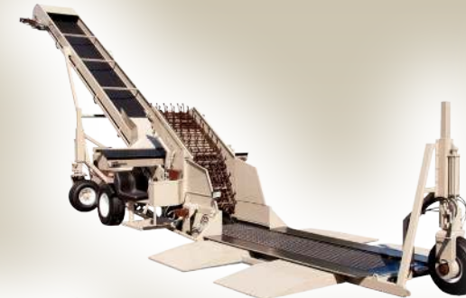
Stockpiling Elevator Self-propelled belly dump elevator for ultra-fast stockpiling