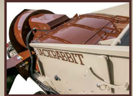
Adjustable damper to fine tune airflow