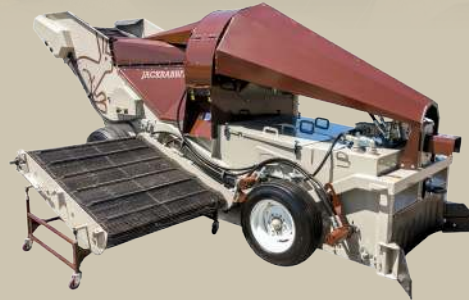
Pickup head and cleaning cartridges for rapid repair