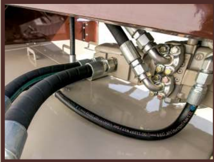
Hydrostatic pump for variable fan speed

Lower Dust – Cleaner Product – Faster Speed