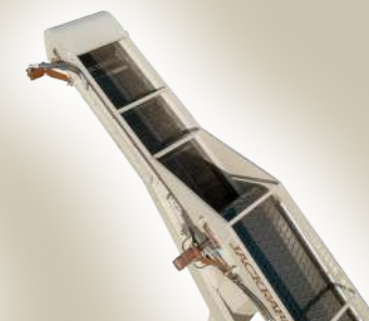
Dirt Chain Heavy duty twin-rod chain