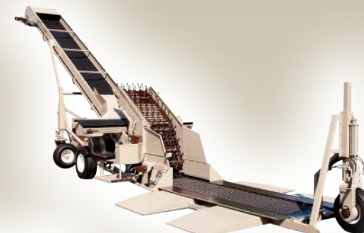
Stockpiling Elevator Self-propelled belly dump elevator for ultra-fast stockpiling