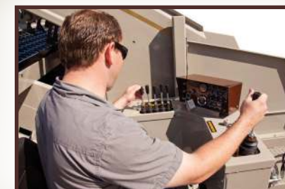
Controls Operator platform with intuitive controls