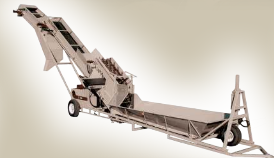
Dirt Extraction Elevator Dual belt elevator with upper dirt extraction chain